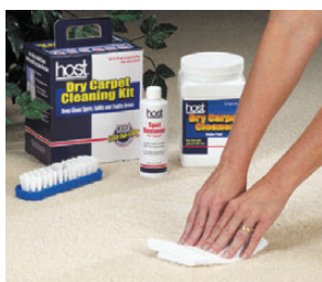
Blot up excess moisture.

If traces of the spot remain, follow procedures in E. Stubborn Spots .