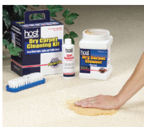
Pack area with a handful of HOST Dry Carpet Cleaner.