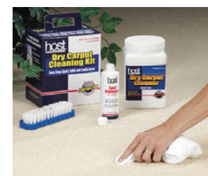
Blot stubborn spots & spills with HOST Spot Remover.

*HOST Spot Remover or other liquids (unless specified) are not recommended for use on natural fiber carpet and rugs.